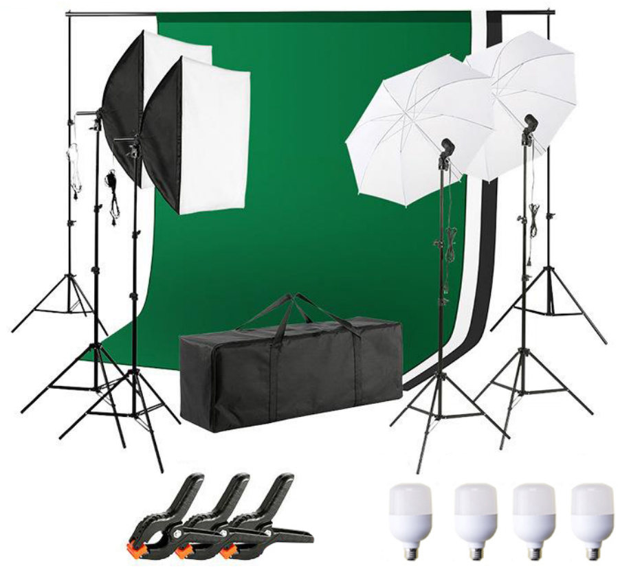
Photo studio set User Manual